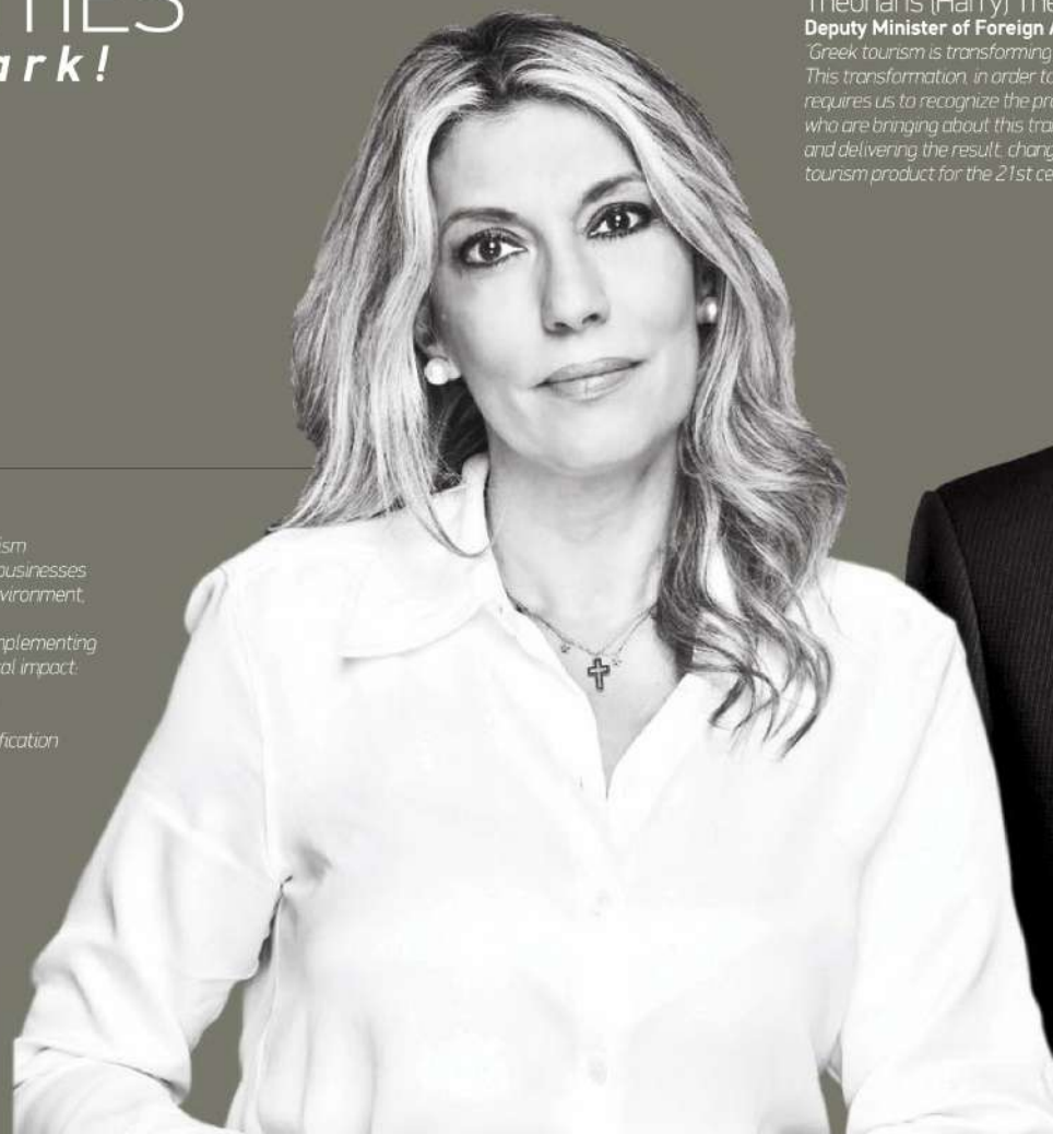
Theoharis (Harry) Theoharis Deputy Minister of Foreign Affairs

"At the Ministry, we are working toward tourism that creates development opportunities for businesses without losing its balance, respect for the environment, and the identity of our country. In this direction, we have launched and are implementing a set of interventions with immediate practical impact, financing significant infrastructure projects, with an emphasis on special forms of tourism, in order to strengthen the diversification of the tourism product".